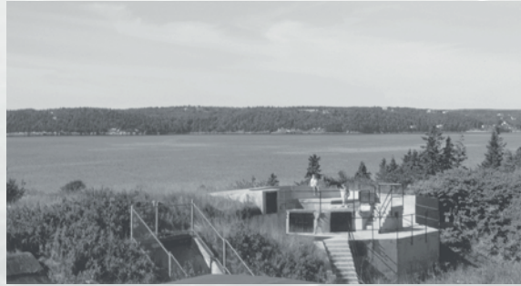
Fort McNab National Historic Site of Canada

During WWI and WWII, the island was largely under military control. The island played a key role in controlling access to Halifax Harbour. Searchlights on McNabs Island patrolled the Harbour and submarine nets were laid between the island and mainland.