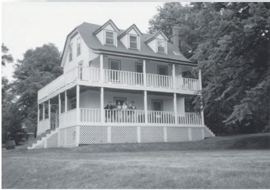
Conrad House on McNabs Island

When Edward Cornwallis established a British settlement in Halifax in 1749, he granted most of McNabs Island to his nephews. Then in 1782, Peter McNab purchased the island for £1000 from the Cornwallis family. Under the McNab family, the island